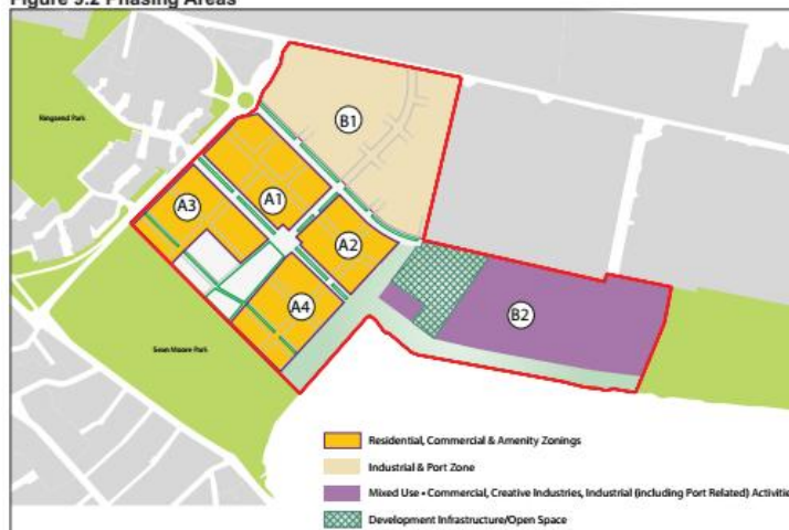
Figure 9.2 Phasing Areas